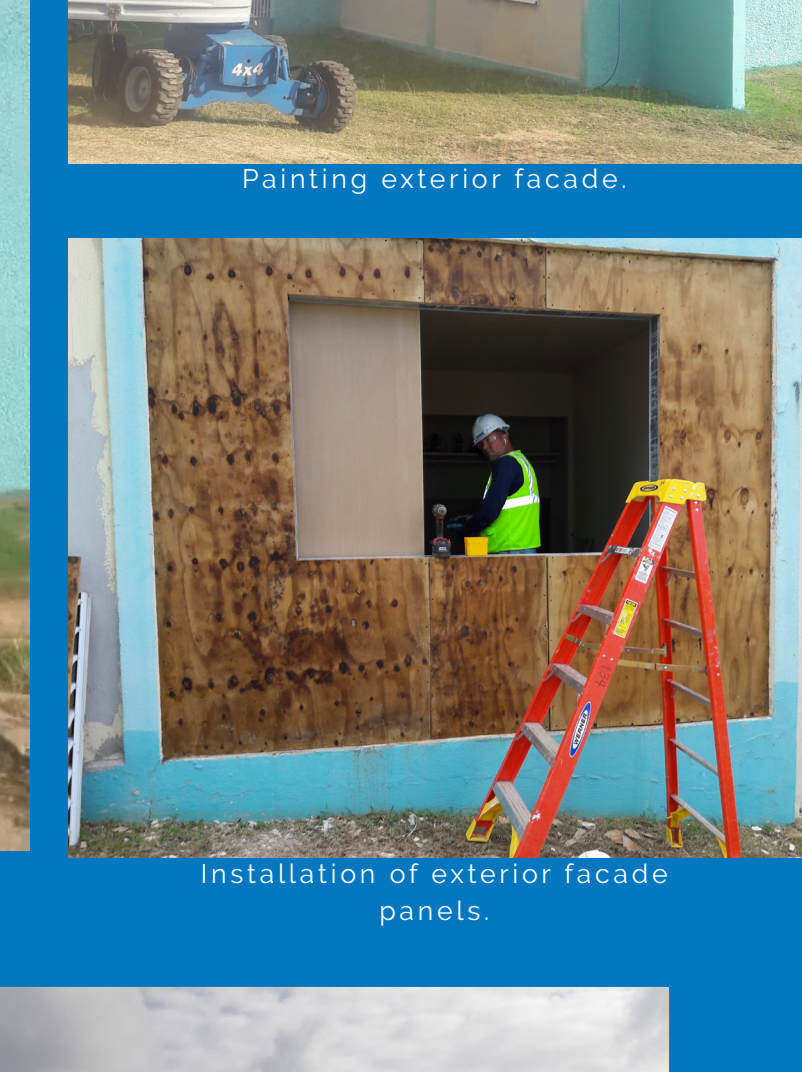
Exterior finishes in progress.