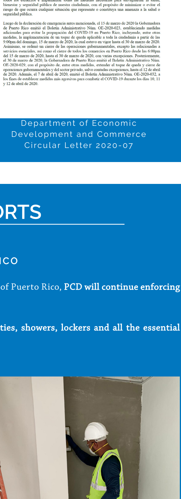
Government of Puerto Rico's Executive Order 2020-029